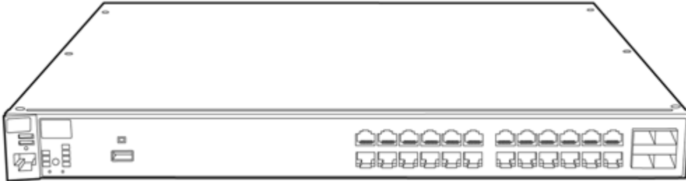
HP 2910-24G al Switch